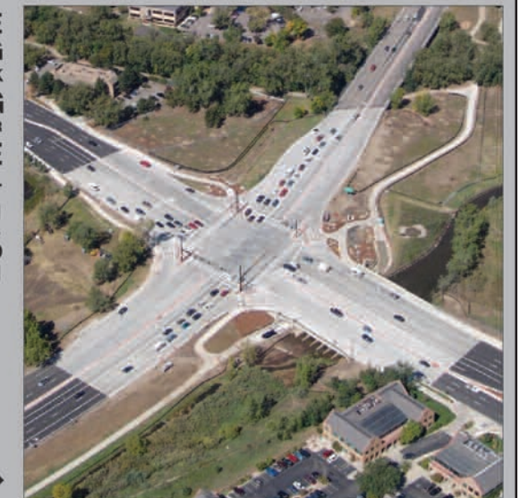
FOOTHILLS PARKWAY/ARAPAHOE AVE.

303.665.2933 www.concreteworksofcolorado.com