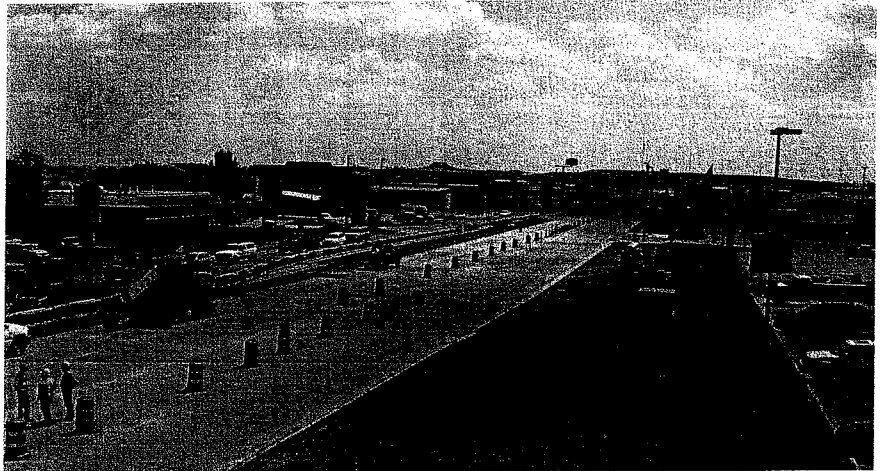
A widened stretch of WYO 59 in south Gillette takes shape.

The busy Gillette project schedule is a reflection the steady increase in traffic from continuing energy development in the area. From 2000 to 2007, Gillette posted a 23-percent increase in population, tops among Wyoming's larger municipalities, while surrounding Campbell County posted a 20-percent increase, second only to Sublette County.